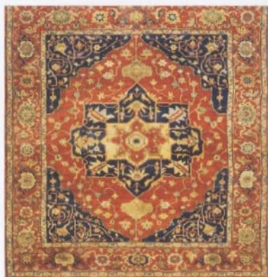
From top: fabrics from Soane; taps by Daum at Bathrooms International; 'Eastwood' carpet from Ralph Lauren Home;