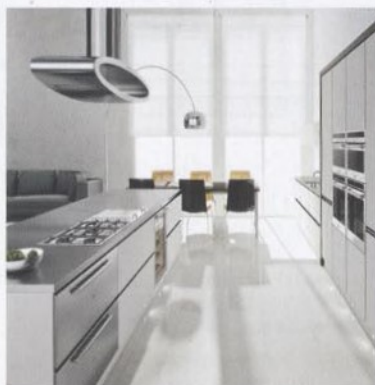
flooring by Art/Deco Parket; carved stele at Westland London; table at Talisman; stainless-steel kitchen by Scholtès