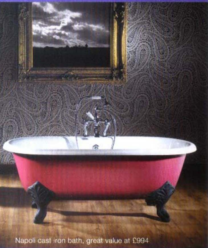
Napoli cast iron bath, great value at £994

exclusive designs extensive stocks exceptional value expertise and advice