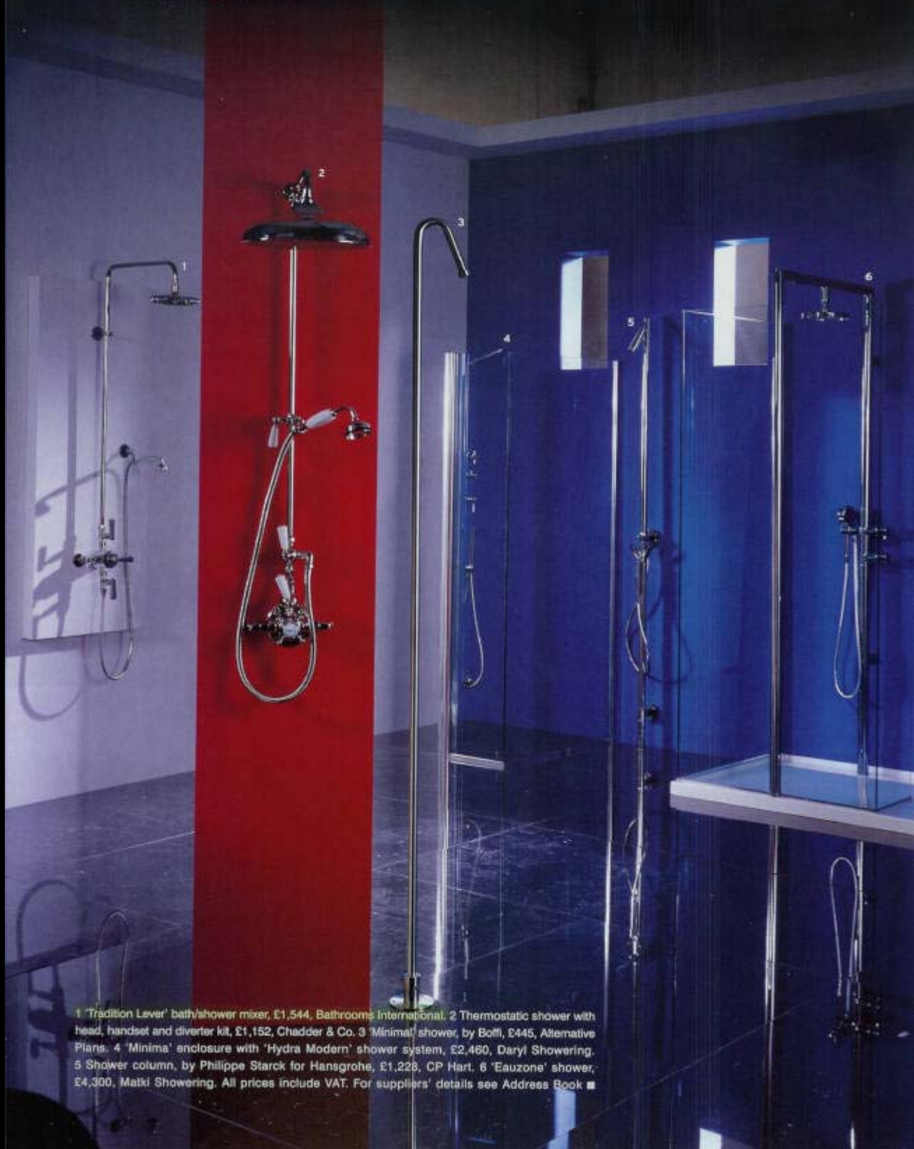
1 'Tradition Lever' bath/shower mixer, £1,544, Bathrooms International. 2 Thermostatic shower with head, handset and diverter kit, £1,152, Chadder & Co. 3 'Minimal' shower, by Boffi, £445, Alternative Plans. 4 'Minimal' enclosure with 'Hydra Modern' shower system, £2,460, Daryl Showering. 5 Shower column, by Philippe Starck for Hansgrohe, £1,226, CP Hart. 6 'Eauzone' shower, £4,300, Matki Showering. All prices include VAT. For suppliers' details see Address Book ■