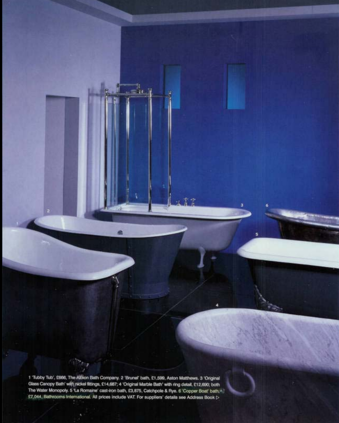
1 'Tubby Tub', £866, The Albion Bath Company. 2 'Brunel' bath, £1,599, Aston Matthews. 3 'Original Glass Canopy Bath' with nickel fittings, £14,687; 4 'Original Marble Bath' with ring detail, £12,690; both The Water Monopoly. 5 'La Romaine' cast-iron bath, £3,875, Catchpole & Rye. 6 'Copper Boat' bath, £7,044, Bathrooms International. All prices include VAT. For suppliers' details see Address Book >